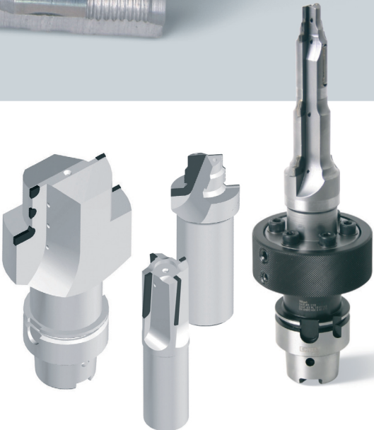
PCD step reamer, endmill Pump housing cutting